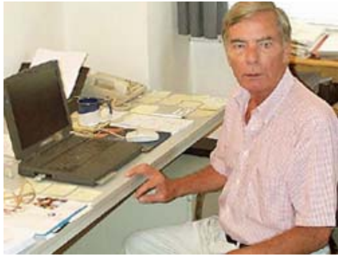
Philip Agee at his office in Havana

immigrants, and Muslim immigrants in particular. There will be some opposition to this; but historically, the courts have usually gone along with the government, even though they are theoretically supposed to be the guarantors of civil liberties. For example, the courts went along with the internment of Japanese-Americans during World War II. So, it will be possible to restrict, and even infringe upon, civil liberties and human rights in the United States.